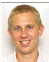
Justin Urman Promotions