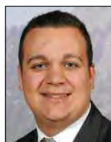
Kyle Geddes Promotions