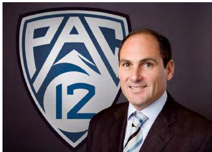
Pac-12 Commissioner Larry Scott

The Pac-12 Conference offices are located 25 miles east of San Francisco in Walnut Creek, Calif.