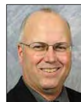
Bart Emery Coors Events Center